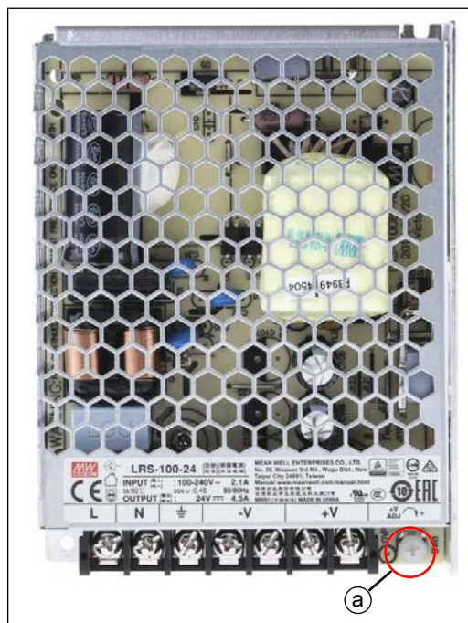
a Output voltage setting